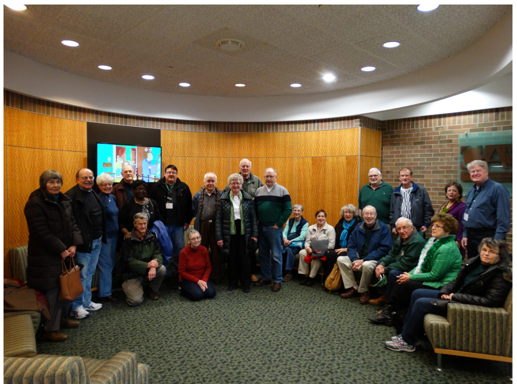
MSURA members enjoyed a visit to WKAR in February. WKAR is part of the College of Communication Arts & Sciences.